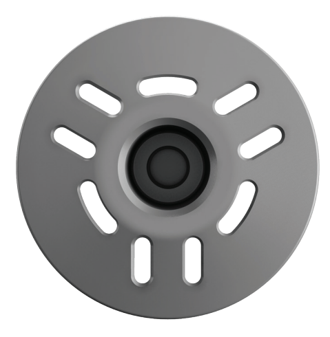
Osteotome slots work with specific removal instruments to minimize impact on bone during revision surgery.