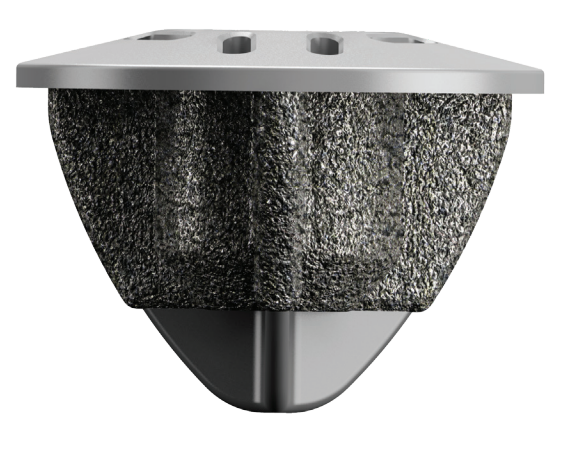
Low profile collar evenly distributes loads and resists subsidence while one-piece design eliminates risk of disassociation.