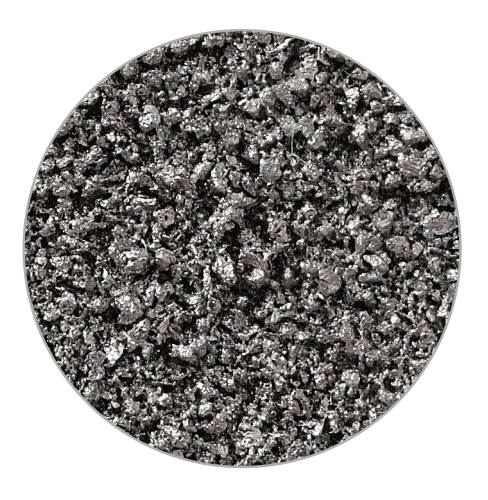
Highly porous coating designed to provide initial stability while allowing for bone ingrowth.