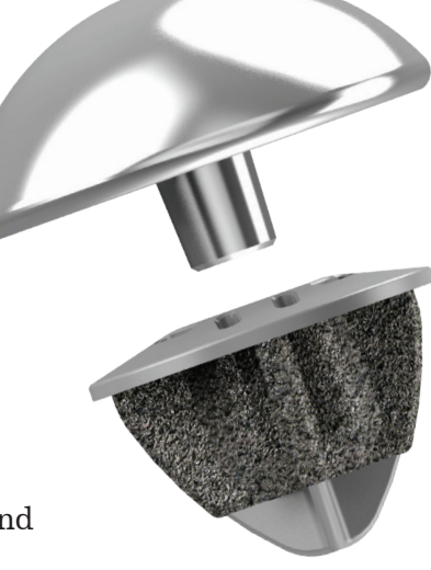
Female taper makes glenoid visibility manageable

<sup>B</sup> Rotator cuff weakness (14 months) and aseptic glenoid loosening (18 months)