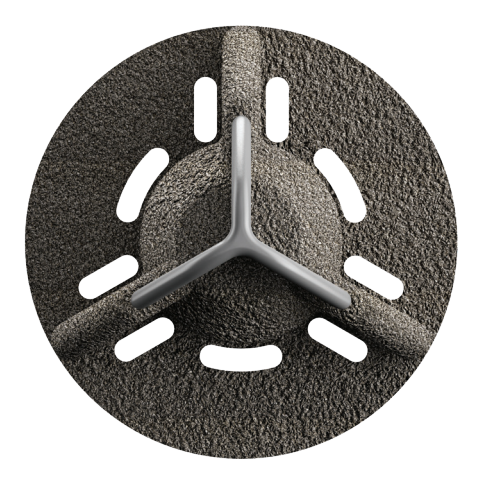
Tri-fin, press-fit design delivers rotational stability.