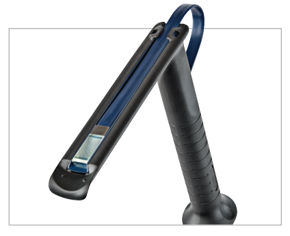
Eikon LT Adapt SE