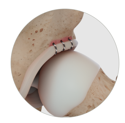
Iconix Knotless anchors support a low-profile repair.