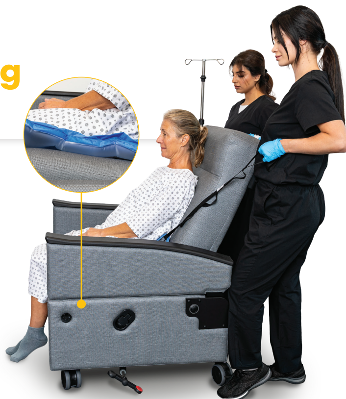
Proper sitting with SPS

In one limited year-to-year implementation