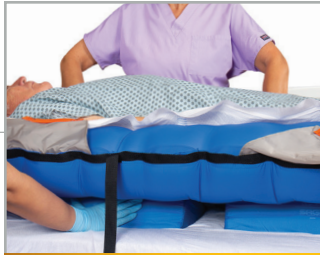
30° Body and Anchor Wedge System