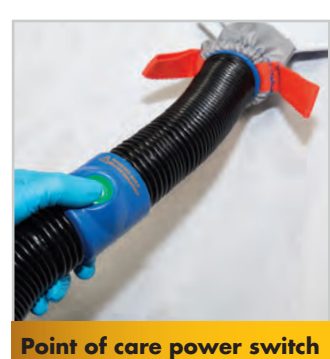
Integrated into workflow to improve efficiency by allowing caregiver to focus on patient at the bedside