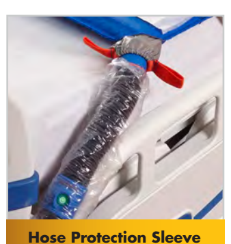
Helps protect hose from environmental contamination