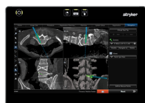
Wall mounted IO tablet