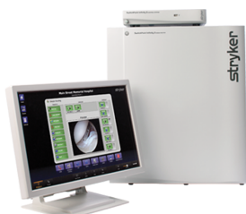
SwitchPoint Infinity Control System