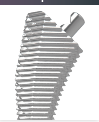
A/P: Compaction teeth enable bone preservation and initial stability