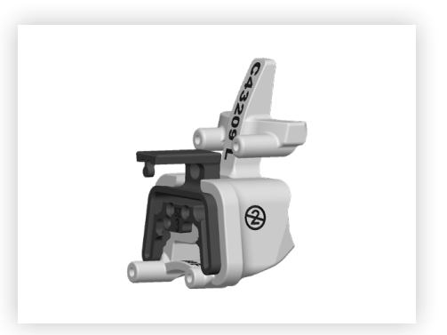
Press fit assembly of components