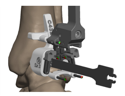
Complete all 3 tibia resections in one, streamlined step