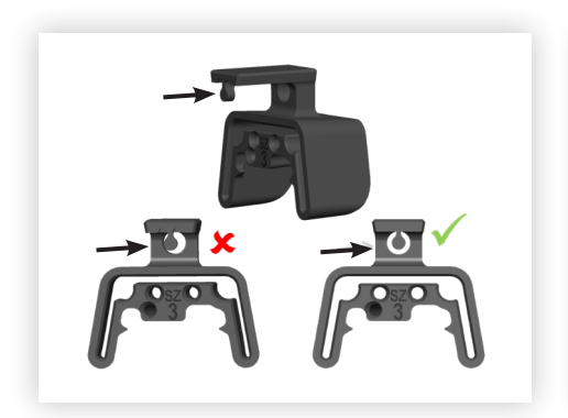
Integrated bulls eye fluoro