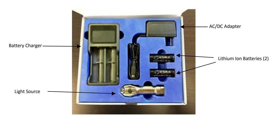
Figure 1 - Portable Red LED Light Source (Catalog Number PRLS-100)

The Light Source package includes the Light Source (with ACMI connector), battery charger (with AC/DC adapter), and two lithium ion battery cells. Refer to Figure 1 below.