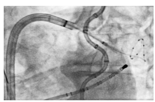
Fluoro image of the Stryker Steerable 12 F sheath and reprocessed CS catheter % \mathcal{F} = \mathcal{F} = \mathcal{F}

In my experience, desirable ablation and clinical end points were achieved by using the Stryker 8.5 F and 12 F Bidirectional Steerable Introducer Sheaths. The sheaths provided increased stability, smoother transition in percutaneous and transeptal course with minimal resistance, better grip and handling of the ergonomically designed handle compared to the market leading sheaths. The 12 F Stryker Steerable Introducer Sheath also provides the advantage of bidirectionality which is helpful in complex cases.