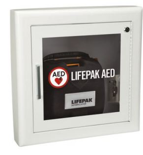
Semi-Recessed (3" Return)

AED Wall Cabinet with Alarm and Strobe 11220-000083 (White) 11220-000084 (Stainless)