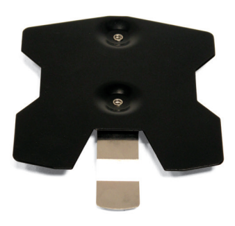
SMRT charger mounting bracket