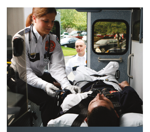
Vehicle-ready and crash-tested SMRT charger and pak are in-ambulance mountable and crash-tested.