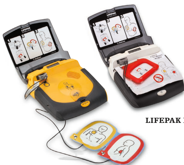
LIFEPAK EXPRESS AED

Only Stryker accessories and disposables have been thoroughly tested with LIFEPAK products. Stick with the name you trust and the company that stands behind it. To order, contact your Stryker representative.