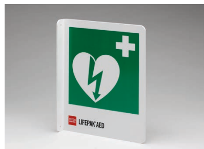
T-mount ILCOR Location Sign 11998-000328 (w/logo, 8" x 10")