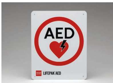
Flat AED Location Sign 11998-000330 (w/logo, 8" x 10")