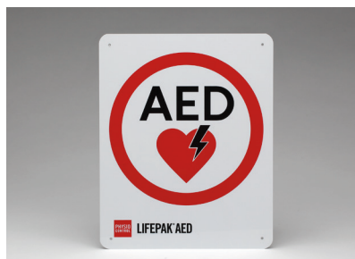
Flat AED location sign 11998-000330 (w/logo, 8 inches x 10 inches)