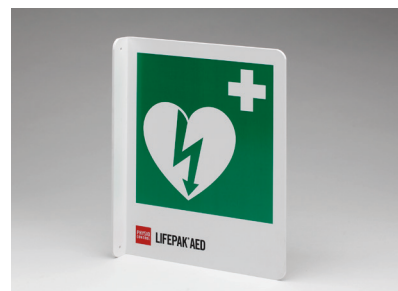
T-mount ILCOR location sign 11998-000328 (w/logo, 8 inches x 10 inches)