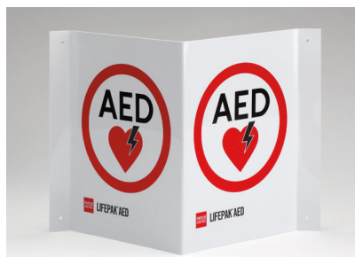
Tent AED location sign 11998-000332 (w/logo, 7 inches x 8 inches)