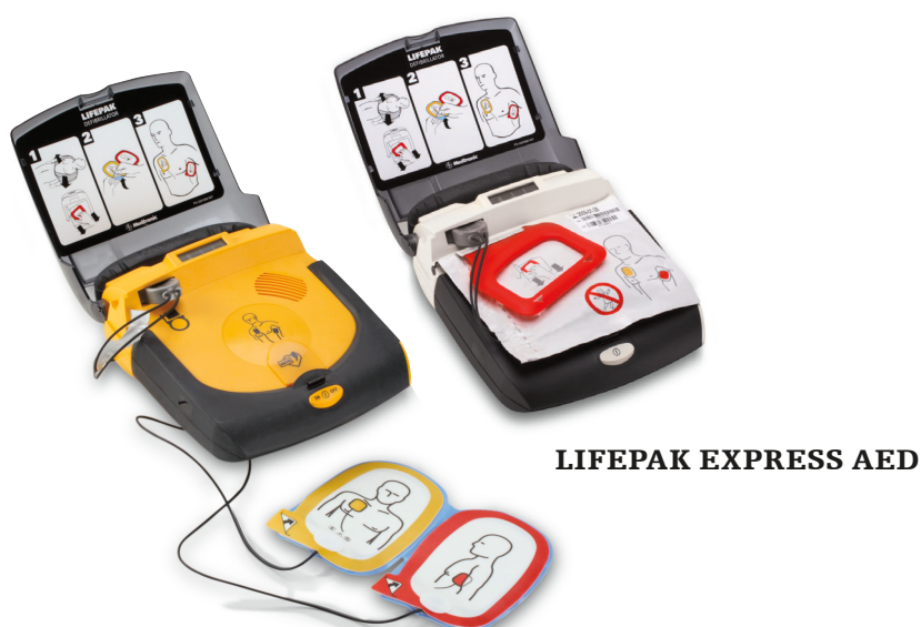
LIFEPAK EXPRESS AED

Help increase the safety of your staff and patients. Only Stryker's accessories and disposables have been thoroughly tested with LIFEPAK products. Stick with the name you trust and the company that stands behind it. To order, contact your Stryker representative.