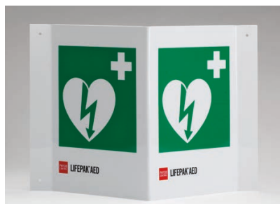
Tent ILCOR Location Sign 11998-000329 (w/logo, 7" x 8")