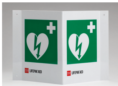
Tent ILCOR location sign 11998-000329 (w/logo, 7 inches x 8 inches)