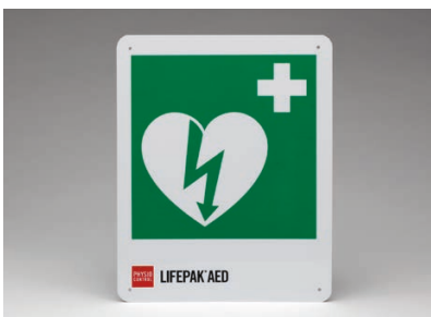
Flat ILCOR Location Sign 11998-000327 (w/logo, 8" x 10")