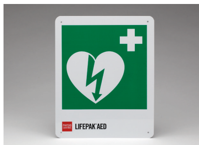
Flat ILCOR location sign 11998-000327 (w/logo, 8 inches x 10 inches)