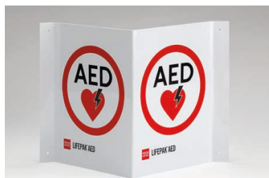
Tent AED location sign