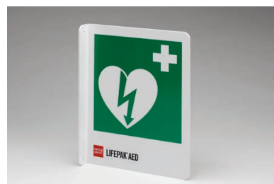
T-mount ILCOR location sign