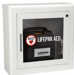
Surface mount (7" return)

11220-000079 (White) 11220-000076 (Stainless)