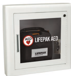
Semi-recessed (3" return)

11220-000083 (White) 11220-000084 (Stainless)