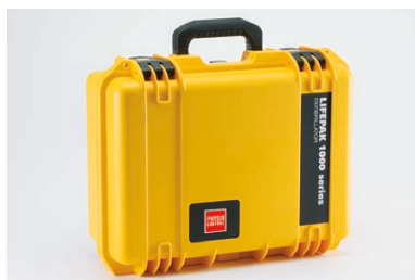
Hard shell, water-tight carrying case

11998-000321 (Attached to case) 11998-000320 (Stored in case)