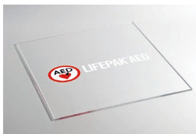
AED cabinet window replacement kit

11210-000028 (White) 11210-000029 (Gray)