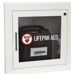
Recessed mount (1.5" return)

11998-000293 (White) 11220-000078 (Stainless)