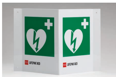
Tent ILCOR location sign