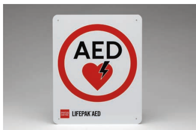
Flat AED location sign