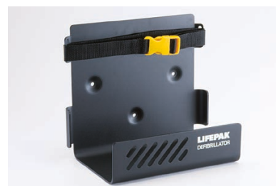
Wall mount bracket for LIFEPAK 1000 or LIFEPAK 500 defibrillators