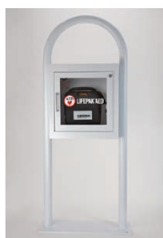
AED floor stand cabinet with alarm