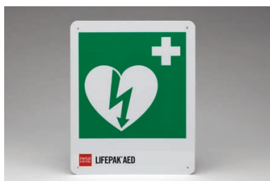
Flat ILCOR location sign