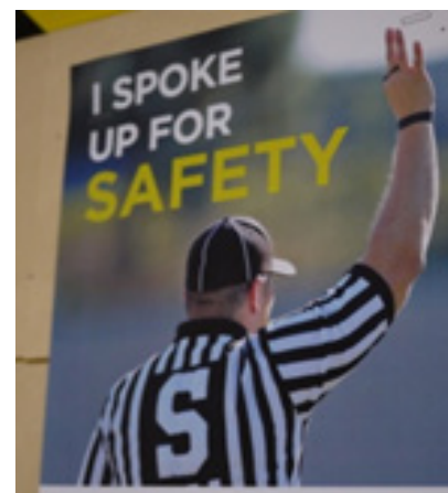
St. Vincent's encourages caregivers to speak up about safety.

During the first year, patient handling injuries decreased 56 percent, and they continue to decrease: from 2012 to 2013, the hospital saw a 27 percent reduction. The success of the current program is also due to management commitment and transparency. Senior executives lead daily safety huddles, and "good catches" (i.e., reported near misses) are treated as opportunities to learn additional ways to improve safety.