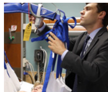
AnMed Health's consultant demonstrates repositioning using a ceiling lift.

When AnMed Health launched a new safe patient handling program in 2011, the hospital decided to hire a consultant to work directly with floor staff to determine and test the right