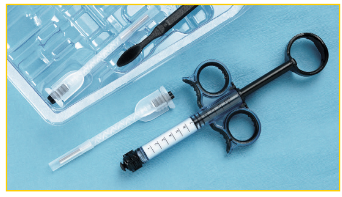
one Mixer-Cannula from the inner blister.