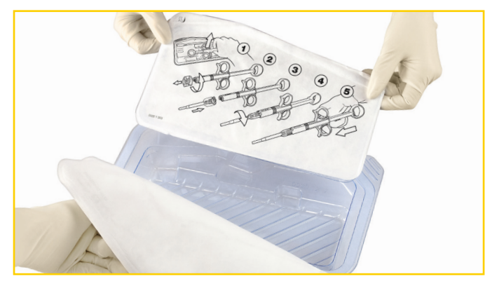
2. Peel back the outer blister lid. Remove the inner blister and transfer to sterile field.