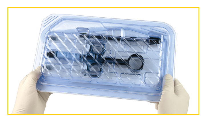
1. Check the packaging and the Directlnject for damage prior to use/surgery.