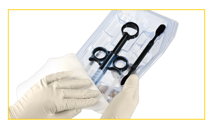
3. Peel back and dispose of the sterile inner 4. Remove the Delivery Syringe blister lid.