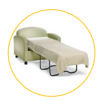
Chair in Sleeper Position