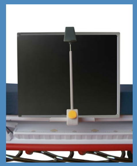
Lateral Cassette Holder