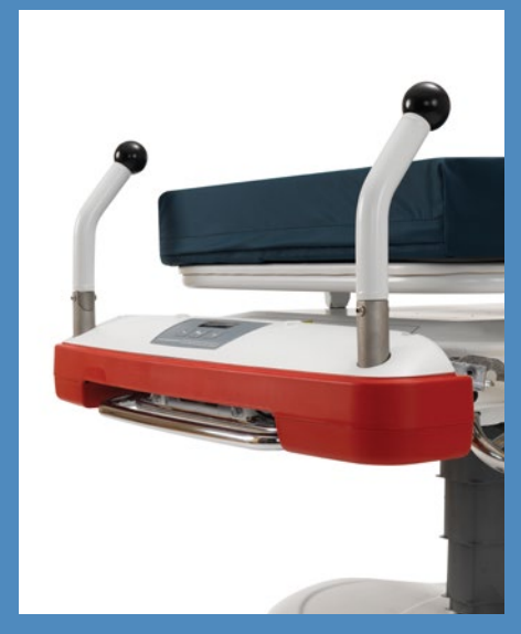
Foot End Push Handles (1105x only)

The Prime X X-ray Stretcher offers the safety and efficiency of the Prime Series Stretcher, now with the Clearview Technology platform.