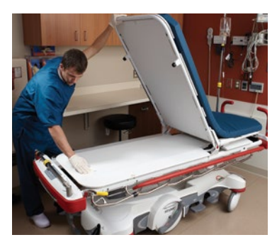
Easy to Raise Foot Section offers enhanced cleanability through convenient access to the cassette platform.