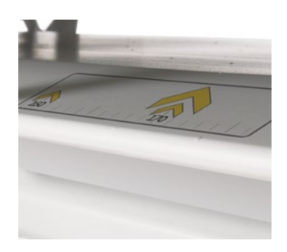
Beveled Edges and Visual Alignment Guides make positioning the cassette to the patient simple.