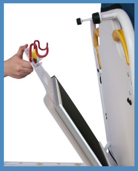
Upright Cassette Holder