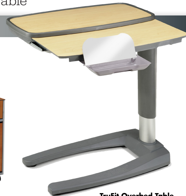
TruFit Overbed Table