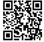
Knee CT Scanning PN 200004