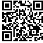
Surgical Guide PN 209708