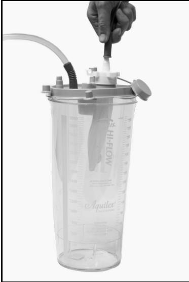
FIGURE 4: ATTACH VACUUM TUBE TO COLLECTION CANISTER