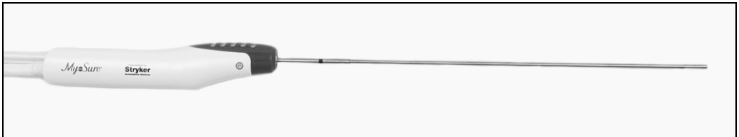
FIGURE 1: REPROCESSED MYOSURE TISSUE REMOVAL DEVICE

The Reprocessed MyoSure Tissue Removal Device is shown in Figure 1. It is a hand-held unit which is connected to the control unit via a 6-foot (1.8-meter) flexible drive cable and to a collection canister via a 10-foot (3-meter) vacuum tube. Cutting action is activated by a foot pedal. The tissue removal device is a reprocessed single-use device designed to hysteroscopically remove intrauterine tissue.