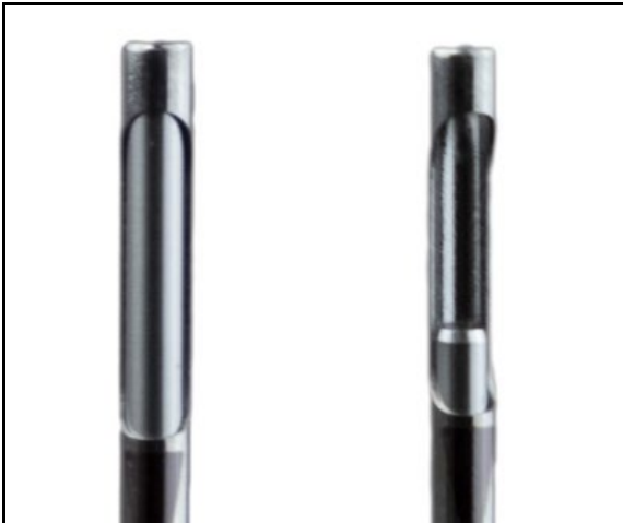
FIGURE 5: Closed Tissue Removal Device Cutting Window on Left

WARNING: Periodic irrigation of the reprocessed tissue removal device tip is recommended to provide adequate cooling and to prevent accumulation of excised materials in the surgical site.