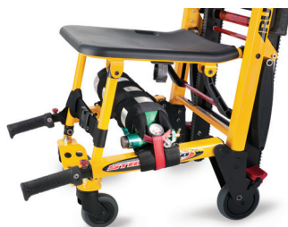
O 2 Holder