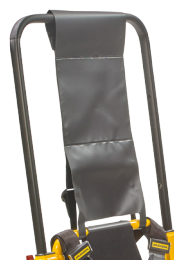
Vinyl head support