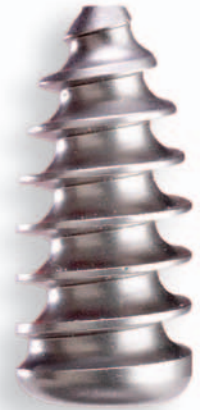
7 x 20mm Universal Wedge Screw 234-010-051