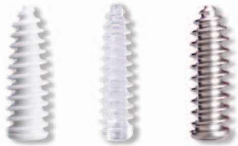
Stryker Wedge Interference Screws