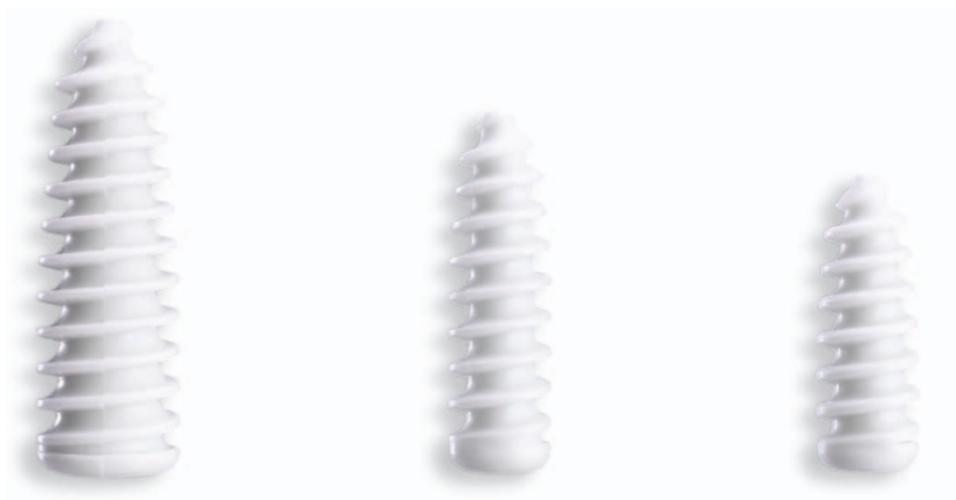
9 x 35mm Biosteon® Wedge Interference Screw 234-010-177