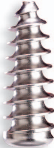
7 x 25mm Universal Wedge Screw 234-010-052