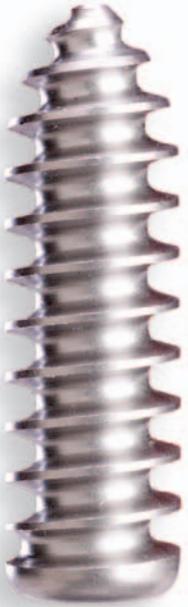
7 x 30mm ACL Interference Screw 234-030-042