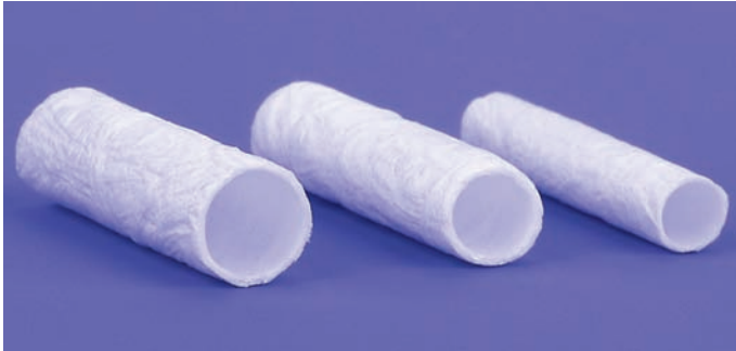
NeuroMatrix™ Type 1 Collagen Conduits

Stryker's NeuroMatrix™ conduit provides a clinically effective, tensionless repair without associated autograft morbidity.