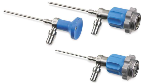
Autoclavable Small Joint Arthroscopes