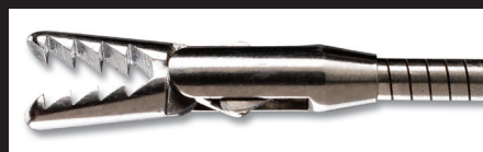
Flexible Grasping Forcep