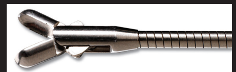
Flexible Biopsy Cup