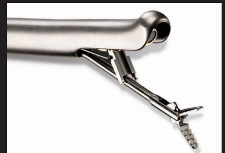
Albarran Bridge with Flexible Grasping Forcep