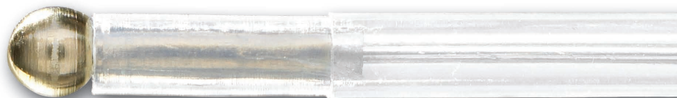
Ball Tip Fulgurating Electrode

* Begin by setting the power low. Gradually increase the power until the desired electro-surgical effect is achieved.