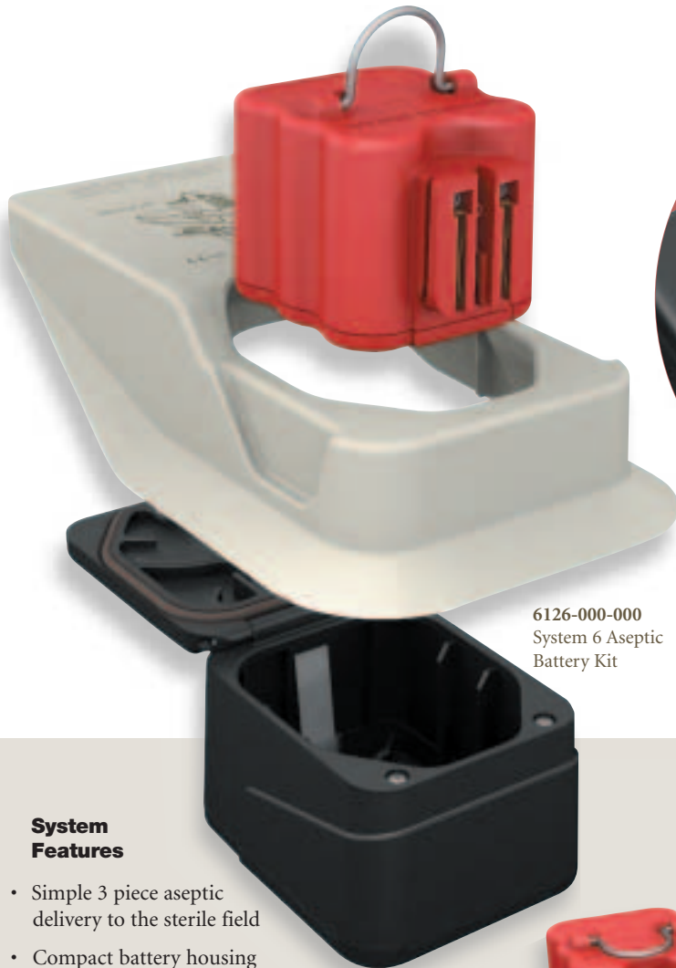
6126-000-000 System 6 Aseptic Battery Kit