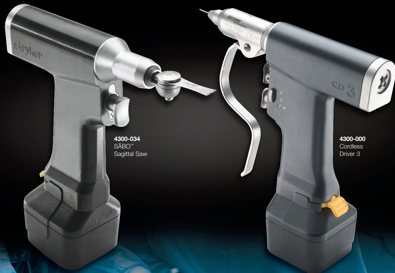
4300-034 SÄBO™ Sagittal Saw