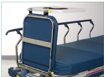
Footboard / Defibrillator