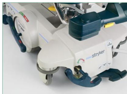
Four-sided Brake / Steer Pedals