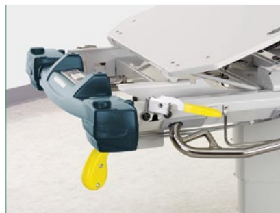
No-crank Knee Gatch

Multiple accessories are available to best configure Stryker stretchers to your facility's needs.