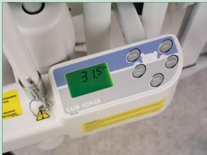
Integrated Scale - Cub Interface