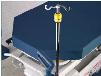
Two-stage IV Pole