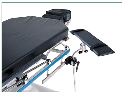
Surgical Accessory Rail