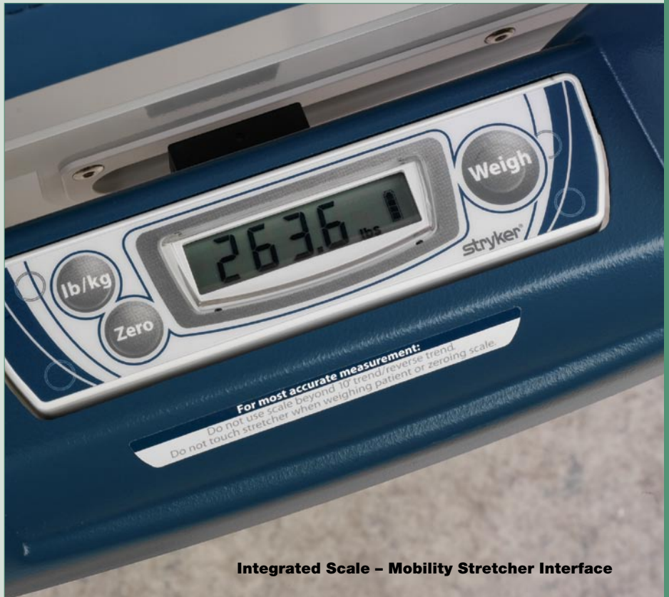
Integrated Scale - Mobility Stretcher Interface

Our integrated scales enable you to retrieve accurate weight readings while the patient remains on the stretcher.