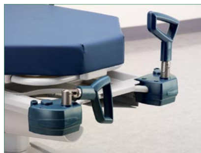
Pop-up Push Handles