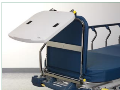
Footboard / Charting Surface