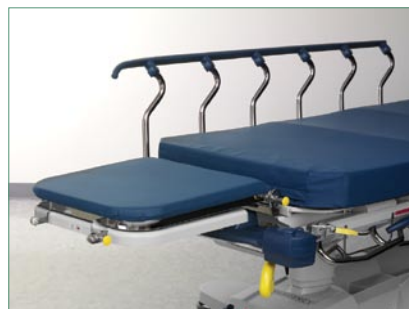
Footboard / Extender