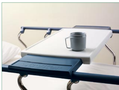
Serving / Instruments Tray