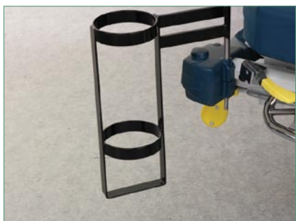
Upright Oxygen Bottle Holder