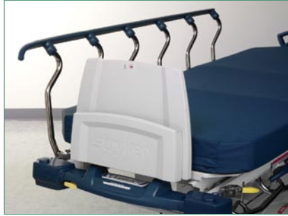
Footboard / Chairholder