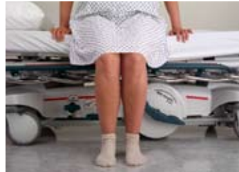
Less than 21-inch Low Height