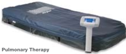
XPRT Advanced Pulmonary Therapy

Stryker's XPRT™ pulmonary wound-care support surface provides rotation, percussion and vibration therapies along with many nurse-assist capabilities.