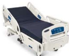
GoBed II® MedSurg Bed