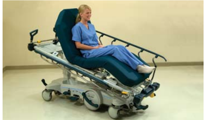
Recovery Chair Position

M-Series stretchers are designed with a zero-transfer gap, best-in-class low height and recovery chair capabilities. These features reduce the frequency and risk involved in patient transfers.