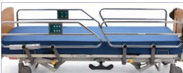
Optional Complete Siderail Coverage