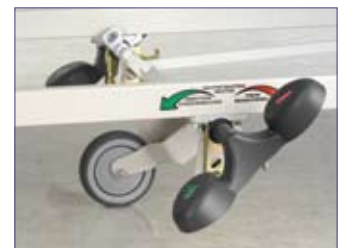
Retractable Fifth Wheel