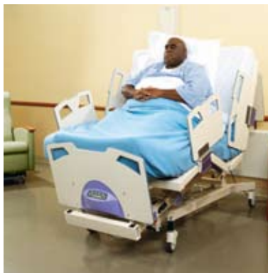
The Stryker Bari 10A offers the perfect blend of aesthetics, versatility, and simple operation.

Hospitals told us they need a bariatric bed that offers advanced ergonomics, is exceptionally easy to operate and is aesthetically pleasing. Stryker has the solution.