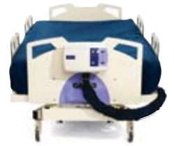
Both Sides Extended

Stryker Bariatric innovations help increase patient comfort and safety while making everyday tasks easier for caregivers.