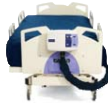
Left Side Extended